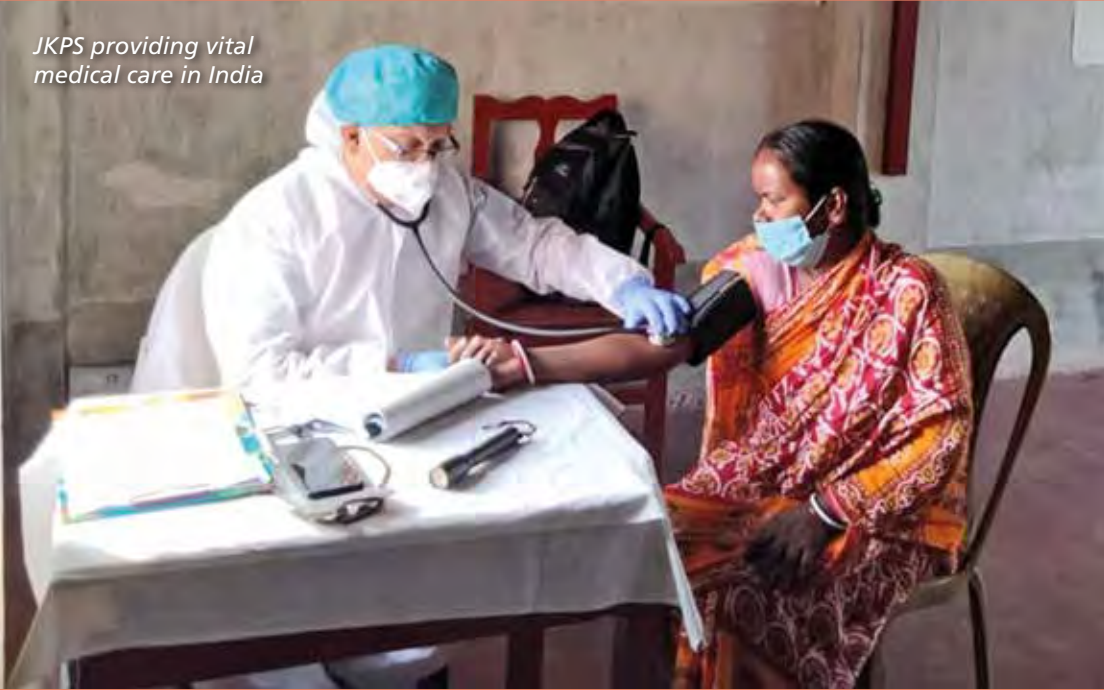
JKPS providing vital medical care in India

Post Fill out the form inside this magazine and return to us.