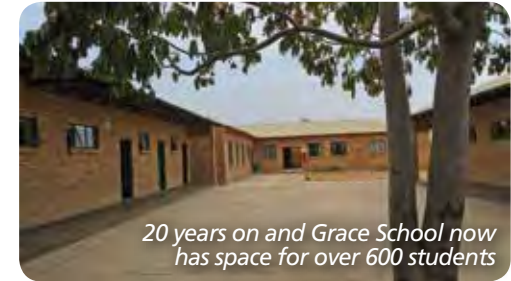
20 years on and Grace School now has space for over 600 students

"We have got an awful lot more out of it, than we have put in. It's been an adventure, it's rewarding to have at least a little part in God's kingdom."