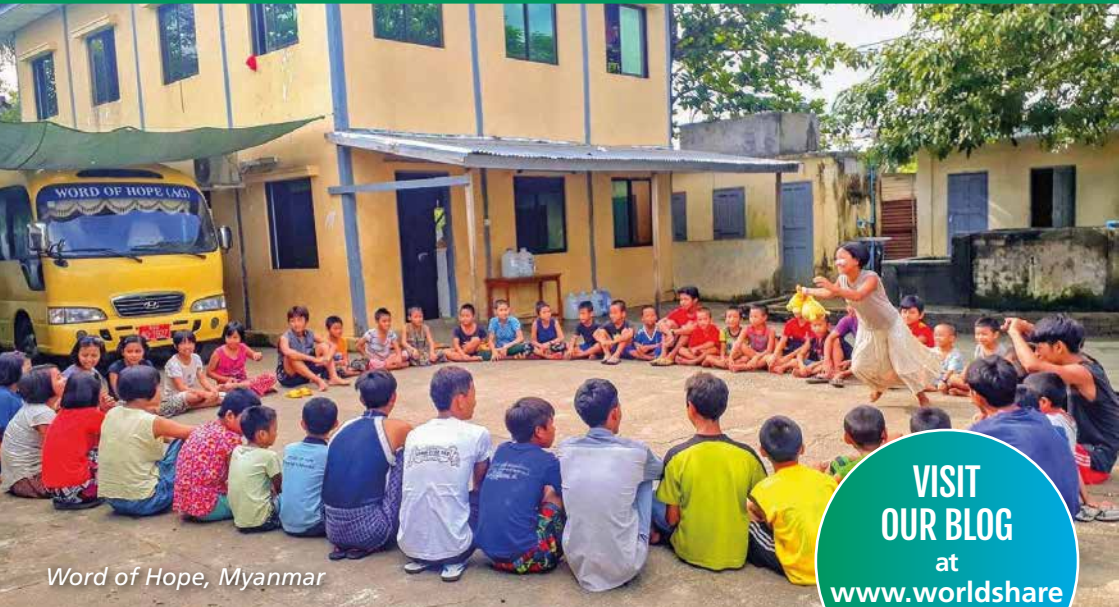
Word of Hope, Myanmar

Post Fill out the form inside this magazine and return to us.