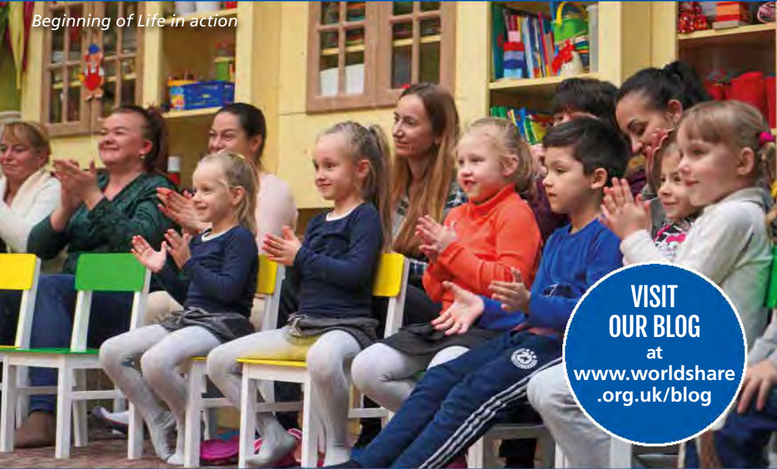
Beginning of Life in action

VISIT OUR BLOG at www.worldshare.org.uk/blog