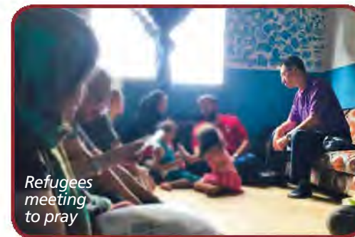
Refugees meeting to pray

FEAL have been ministering in Lebanon and surrounding Arab countries for over 25 years, bringing the Gospel of Hope to the mainly Muslim communities. Since 2011, they have also been witnessing to and discipling Syrian refugees through their Oasis project, bringing both physical help and hope to those who need it most.