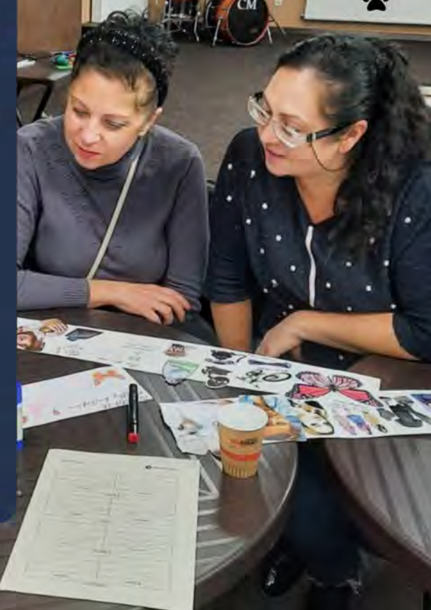
Beginning of Life’s Psychological Arts Studio in Moldova (pages 16-17)