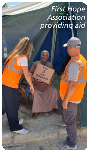
First Hope Association providing aid

First Hope visits these camps daily, providing hygiene kits and other essentials.