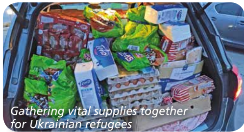
Gathering vital supplies together for Ukrainian refugees

Alongside this, Beginning of Life has been able to call on its years of expertise and experience to provide counselling and art therapy sessions through its Psychological Art Studio, helping people deal with the deep psychological trauma they have experienced.