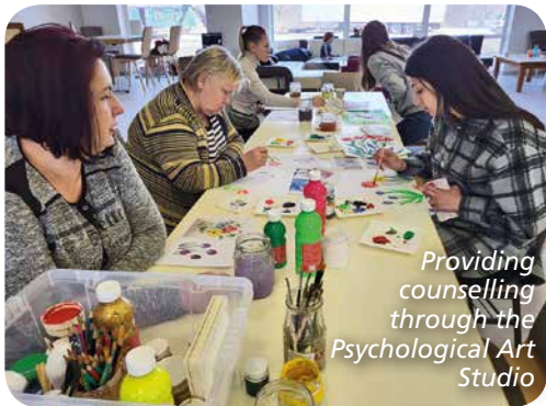
Providing counselling through the Psychological Art Studio

Over 5 million Ukrainians have now fled for their lives to neighbouring countries as the devastating conflict continues in Ukraine. Nearly 100,000 have taken refuge in Moldova, the poorest country in Europe, and have been welcomed in with loving arms by local ministry partner Beginning of Life. Through the immense generosity of WorldShare supporters, and in partnership with local churches, Beginning of Life has been able to support these refugees holistically by providing physical, psychological and spiritual care.