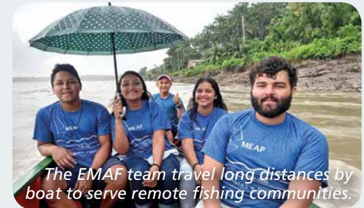
The EMAF team travel long distances by boat to serve remote fishing communities.

The team also limits the exploitation of the ecosystem by promoting community gardens, teaching people how to raise poultry and providing environmental education. For example, in the Delta do Parnaíba area, where litter was once freely spread about, there are now bins, collected regularly, and notices to promote the benefits of picking up litter.