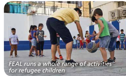
FEAL runs a whole range of activities for refugee children

Hana is one of many displaced children who feels like a child again because of FEAL's Oasis programme. Despite the difficulties these children experience, those who attend have a safe place where they can learn, grow in their faith and find community.