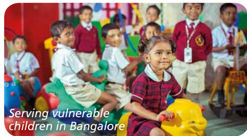
Serving vulnerable children in Bangalore

Bangalore City Mission (BCM) serves families living in poor, urban communities surrounding the rock-cutting quarries of Bangalore, India. A place where families endure back-breaking work and a life of exploitation. BCM is helping transform the lives of these families by providing opportunities for education, vocational training and child-care services.