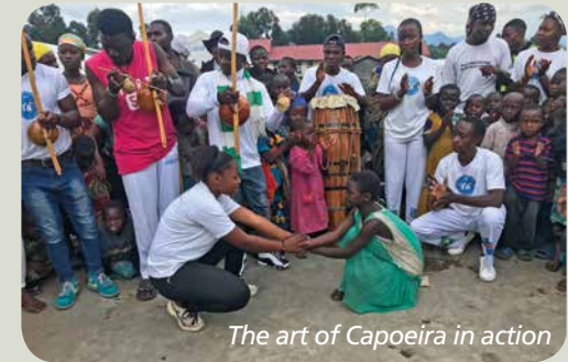
The art of Capoeira in action

well as those who have been reunited but are dealing with the continuing trauma of what has happened.