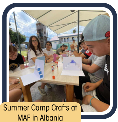
Summer Camp Crafts at MAF in Albania

Praise God for the growth of the education programme in the Western Region of Guatemala, run by Potter's House, now serving 43 Treasures, and for families newly involved in church life.