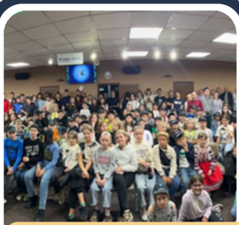
Young people enjoying activities at Beginning of Life, Moldova