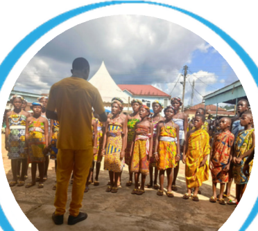
District Cultural Festival at High Priest Academy, Ghana

Pray for WorldShare's Board meeting today, asking God to give wisdom, unity and clear direction as trustees consider the needs, opportunities and priorities of the ministry.