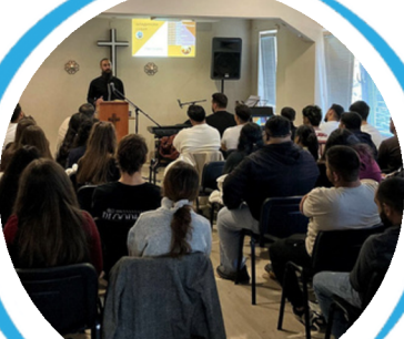
Youth Seminar at EC Veles in North Macedonia