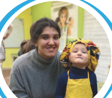
Beginning of Life's 'Toddler Studio', Moldova

Give thanks to God that Living Word of Faith in Ghana were able to feed 1,000 people at their 'Love Feast! Pray for them as they make plans to hold another one at Easter.