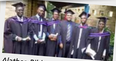
Alatheia Bible College

At the time of my visit, there were 17 students studying part-time, partially supported by WorldShare. These are the future church planters for Africa.