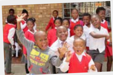
Grace Christian School