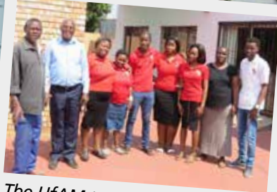
The HFAM team

To fulfil HFAM's main and broader ministry of church planting, the Alatheia (meaning truth) Bible College exists to train both men and women for the ministry.